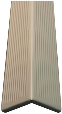
Rake Shake (RS)