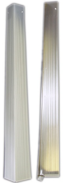
121 Series Corners

The 199 Rake Shake Corners present a deep vertical pattern of straight lines, designed to fit siding styles that incorporate the combed or raked style. These corners have a full wraparound lip on the bottom and a nail hole at the top for easy and secure installation. The material is primed on the outside, and coated on the inside to inhibit corrosion.