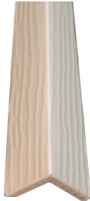
Vertical Grain (VG)