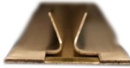
140 Series Joint Covers

140 Series Profiled Joint Covers are intended for use with hardboard siding that is profiled, typically to look like 2, 3, or 4 smaller boards when installed. The Joint Covers protect the butt joint where two siding planks meet and provide an expansion joint to help prevent siding buckling. A wraparound lower lip hooks the siding and requires one nail to hold it in place. They are manufactured with either a smooth or wood grained texture and are available to fit all major brands 12" and 16" profiled shapes.