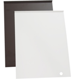
Coated Brown or White Junction Flashing

The Simplicity Tool Junction Flashing is manufactured for all types of siding as a weather resistant barrier at the butt joint seam. This precut Junction Flashing allows for fast and easy installation and the ¼" Slip Fit Positioning Lip insures quick and accurate placement every time. Manufactured from 0.016" primed aluminum, we offer a choice of either brown or white. Simplicity Tool Junction Flashing is a full 6" wide to provide the 3" coverage on each side of the butt joint seam called for by popular siding manufacturer's best practices. Sizes are precut and come 50 pieces per box for fast and easy installation.