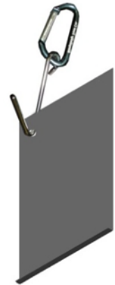
Junction Flashing w/ Belt Hook Kit

The Simplicity Tool Prefinished Junction Flashing are stocked in all of the James Hardie ColorPlus® colors, some of the CertainTeed's ColorMax® colors, and all of the EasyShield™ colors. Colors have been carefully developed and matched for both color and sheen.