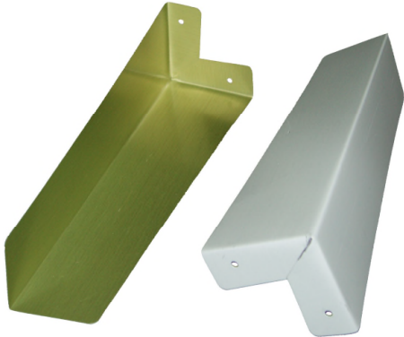
122 Series Corners

The 122 Series corners are the industry standard corner for redwood and cedar siding. Constructed with a right angle flange, these corners come with nail holes for bottom nailing. The corners are available in a wide variety of lengths and flange widths to cover most styles of wood siding.