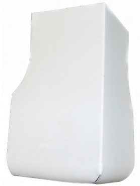
122 Bullnose Pattern 400 Corner

The 122 Series Bullnose corners are a special corner designed to fit and complement 1/2" Rabbeted Bevel Siding Round Edge (Pattern #400). Using our Vintage style sculpted edge, these corners are the perfect complement to round out this very traditional craftsman style. These corners are constructed without nail holes.